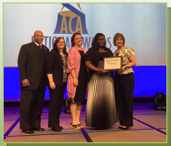
FCA received the ACA Advocacy Award